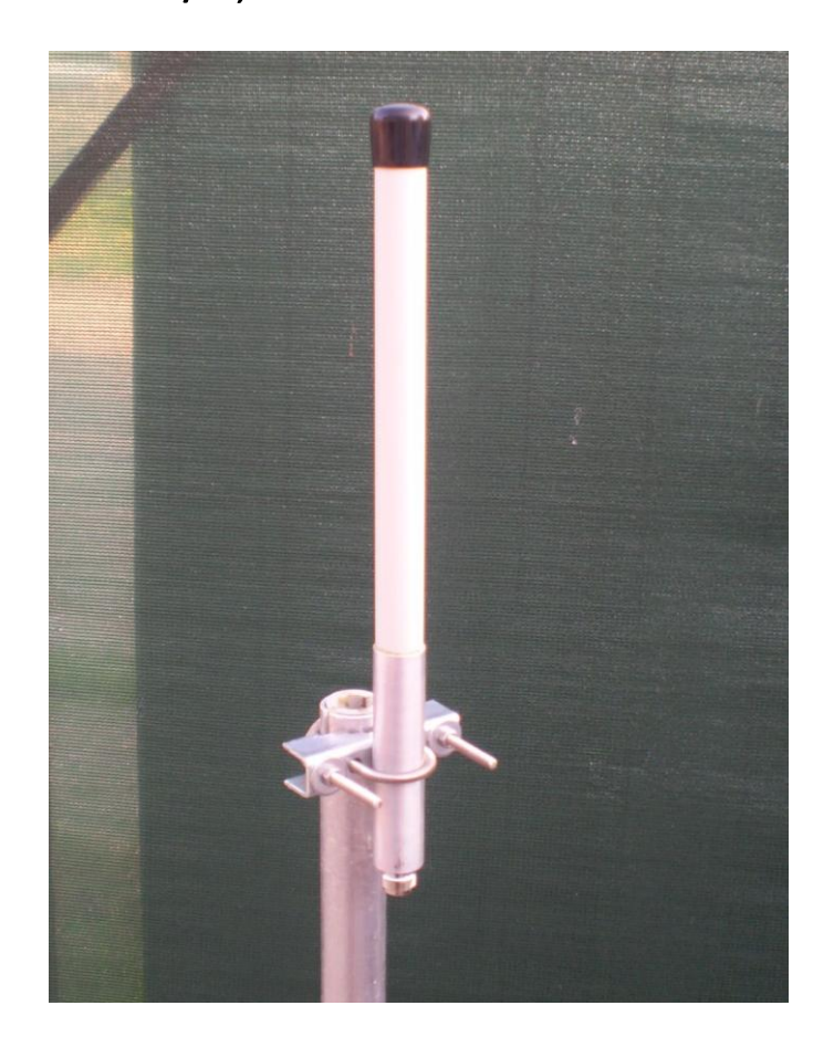
TYPE: TYPE COD433-S