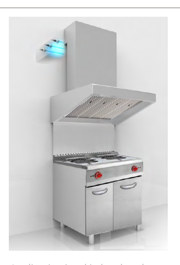
Application in a kitchen hood

UVGI technology is a physic disinfection method with a great costs/benefits ratio, it's ecological, and, unlike chemicals, it works against every microorganisms without creating any resistance.