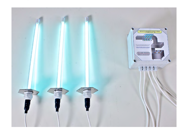
UV-STYLO-S and control board