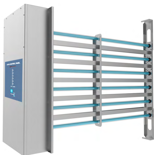
Model with synoptic LED