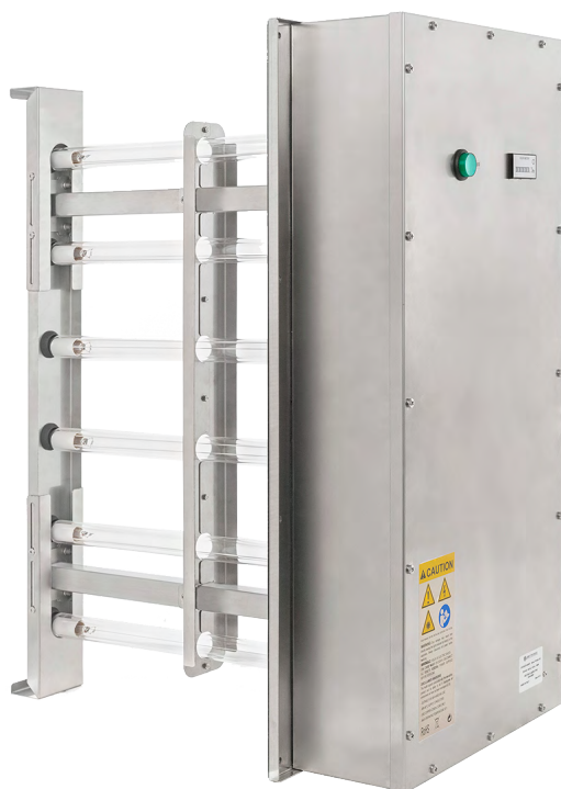
UL Listed model

UV-RACK family includes several modules, of different sizes and wattages, all in stainless steel AISI 304. UV-C lamps are equispaced and positioned in a grid through which airflow in the duct is forced to move.